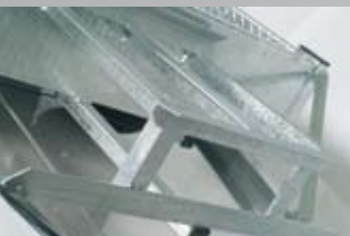
Galvanised Finish for resisting the elements