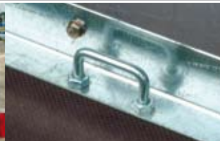
Deck Rings for Goods, Plant, Transporter & Flatbed