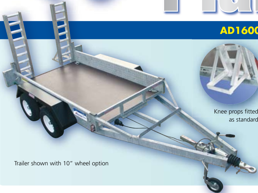
Knee props fitted as standard