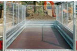
Mesh Kit for Goods, Tipper & Flatbed

A range of options are available for different models. Suitable classes of trailer are listed underneath each particular product. You will also see the list of relevant Optional Accessories available in each Technical Specification panel within this brochure.