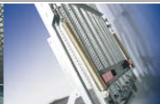
Spring Assisted Ramp Tail for Goods, Plant, Transporter & Flatbed