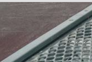
Phenolic Floors for strength and grip