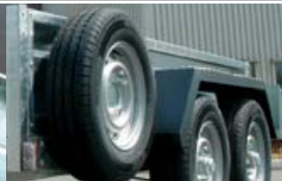
Spare Wheel and Carrier for Goods, Tipper, Transporter & Flatbed