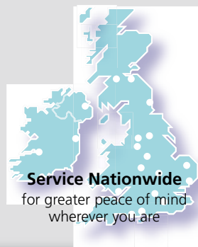
Service Nationwide for greater peace of mind wherever you are