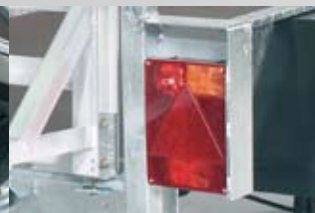
Inset Lighting Clusters for protection in case of small knocks