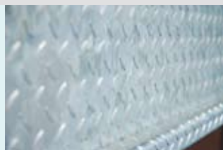
Chequer Plate Construction for greater strength and grip where fitted