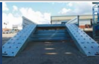
Individual Ramps for Plant, Tipper, Transporter & Flatbed