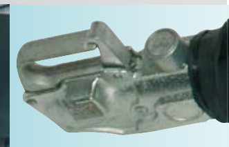
TripleLock Security Coupling Heads for discouraging theft