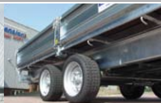
Head Board, Drop Sides and Tailgate for Transporter & Flatbed