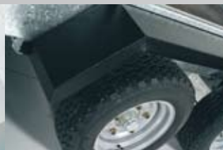
Load Bearing Mudguards for withstanding body weight