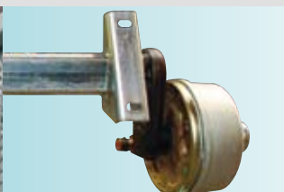
Indespension Suspension for smoother towing even while empty