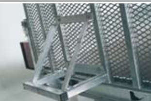
Knee Support for Goods & Plant