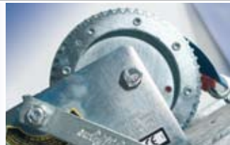
Winch and Strap for Goods, Transporter & Flatbed